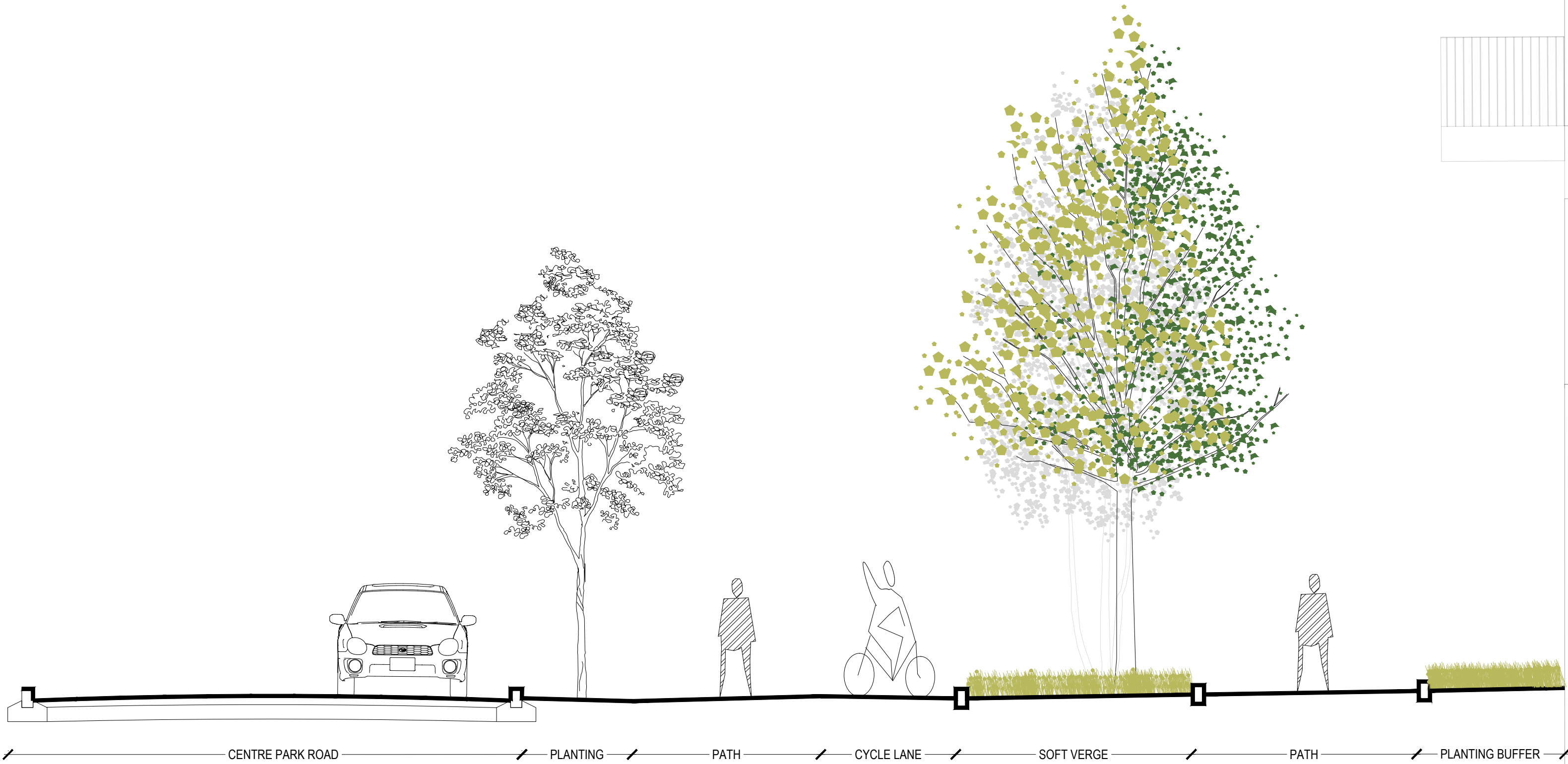
GG LANDSCAPE SECTION GG 0404 SCALE 1:50 @A1