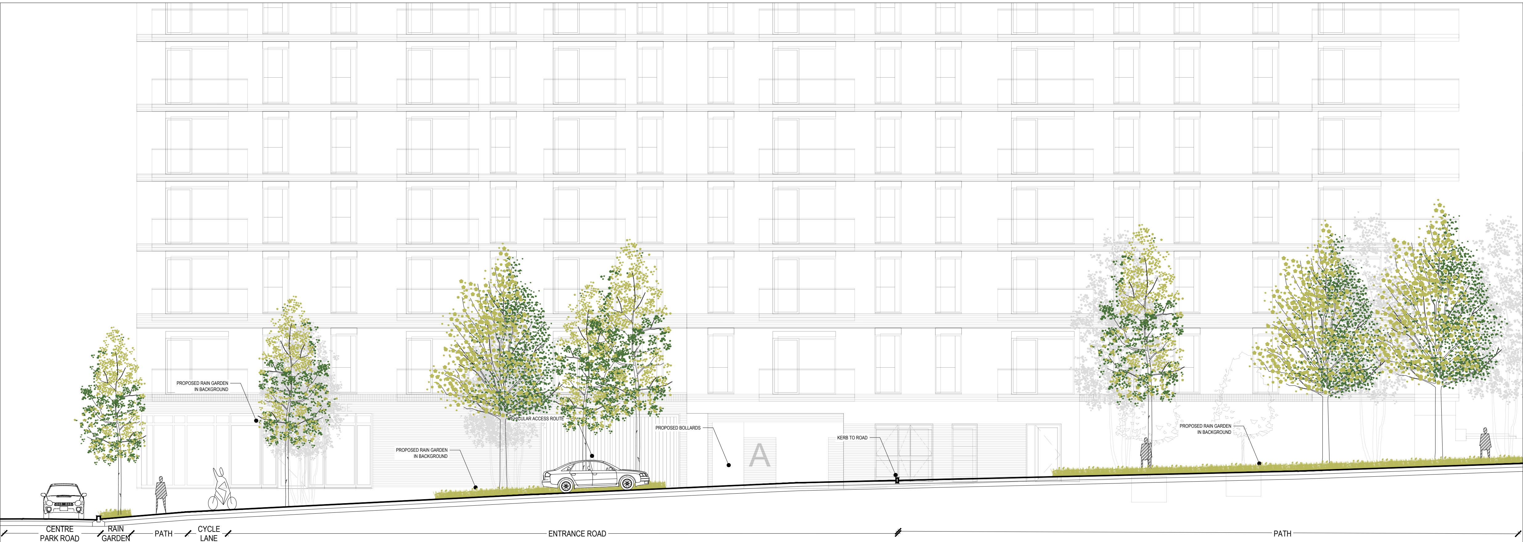
EE LANDSCAPE SECTION EE 0403 SCALE 1:100 @A1