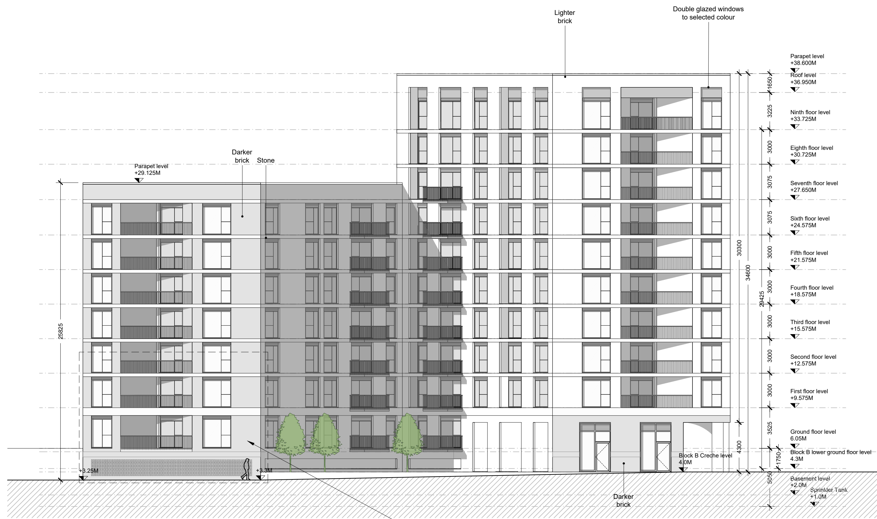
4 PROPOSED BLOCK B ELEVATIONS P4001 EAST ELEVATION SCALE 1:200 @A1

Please refer to drawing FRD_00_ZZ_DR_JFA_AR_P4005 for detailed information on materials