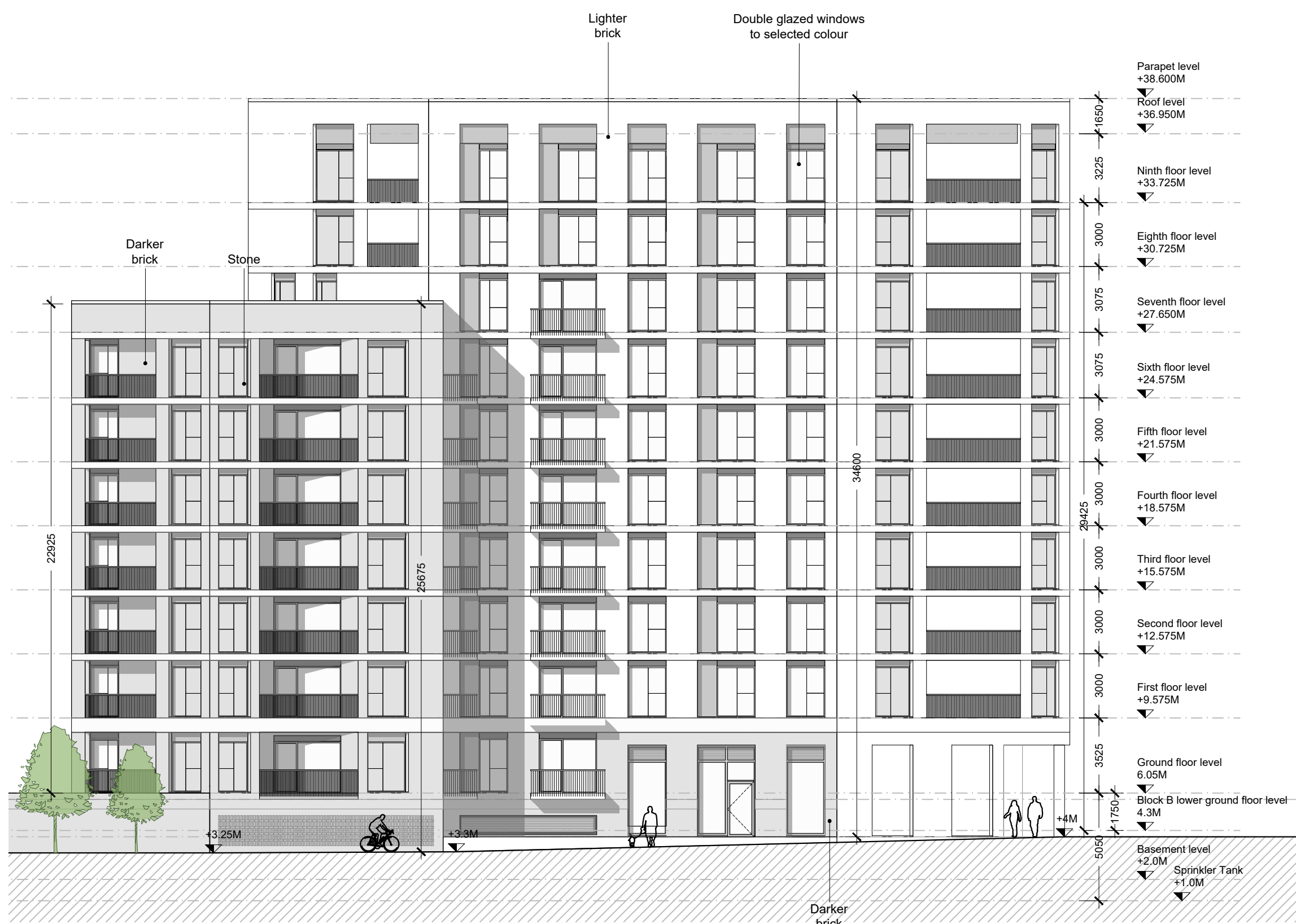
3 PROPOSED BLOCK B ELEVATIONS P4001 NORTH-EAST ELEVATION SCALE 1:200 @A1