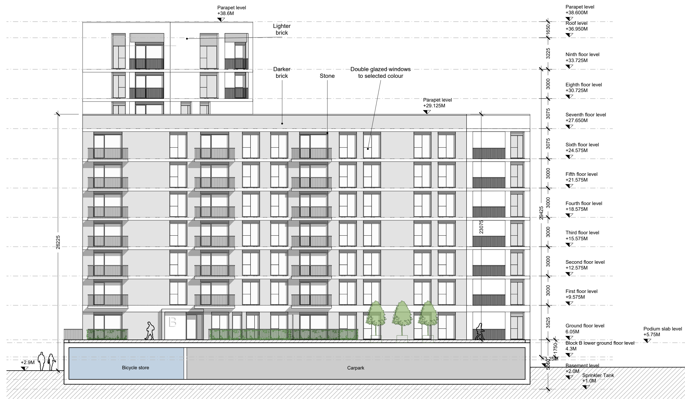
2 PROPOSED BLOCK B ELEVATIONS P4001 SOUTH-WEST ELEVATION SCALE 1:200 @A1