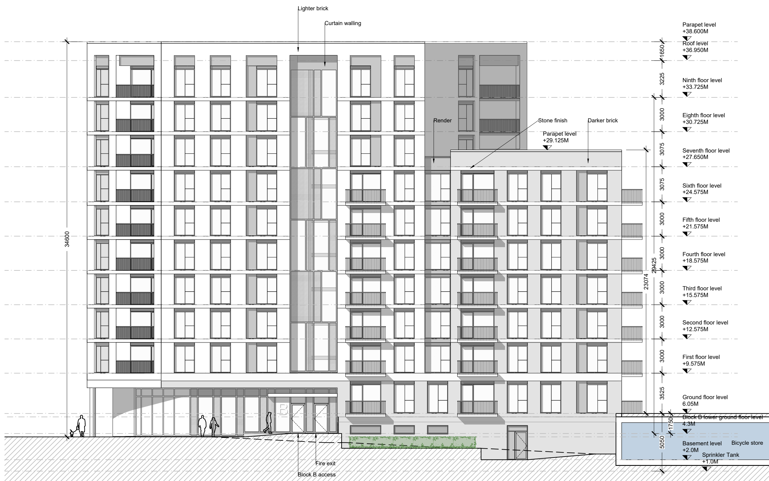
1 PROPOSED BLOCK B ELEVATIONS P4001 NORTH-WEST ELEVATION SCALE 1:200 @A1