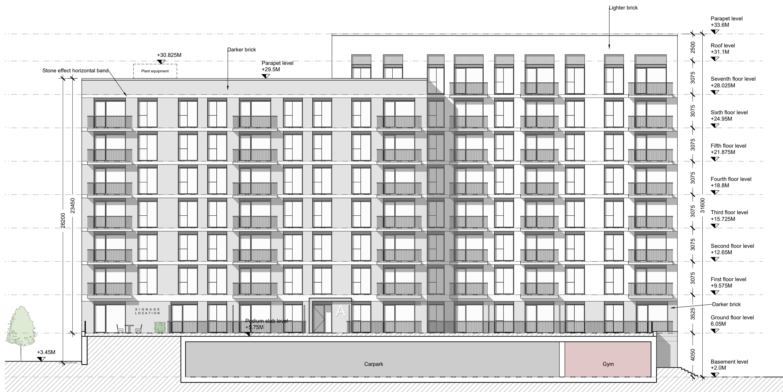
4 PROPOSED NORTH-EAST ELEVATION (4) P4002 BLOCK A ELEVATIONS SCALE 1:200 @A1