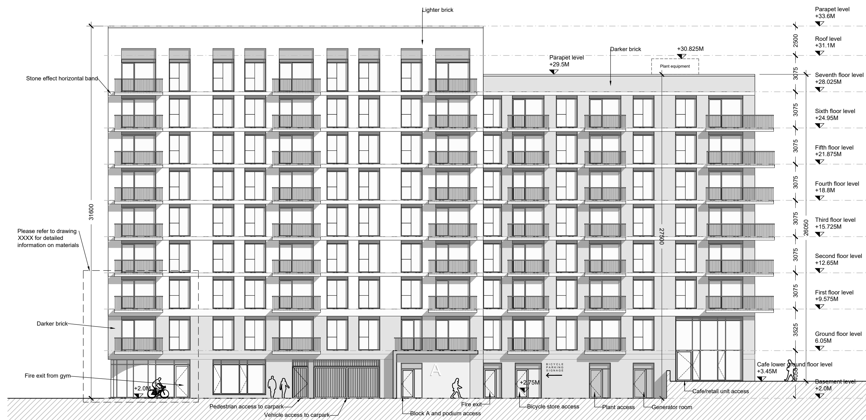
2 PROPOSED SOUTH-WEST ELEVATION (2) P4002 BLOCK A ELEVATIONS SCALE 1:200 @A1